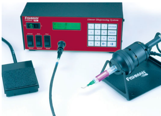
Available for free 30 day trial

Linear Dispensing Systems™— The LDS technology gives you the accurate and repeatable method of positive displacement you want without the headache of pneumatic systems. No need to flush chambers or valves. Formulations stay untouched in safe, silicone-free syringes with this revolutionary new system. Change fluids or volumes with ease.