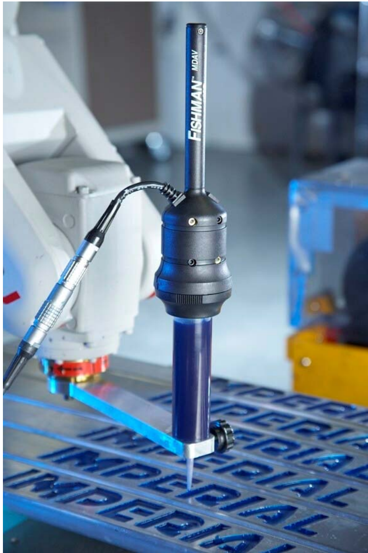
Figure 3. Fishman LDS9000 Mounted in Robotic Arm

What kind of precision is required? “We found,” said Cope, “that the epoxy layer must be between 0.010 in. and 0.015 in. in thickness to fill the letters sufficiently and to ensure consistent color. We have no problem achieving those results with the Fishman product,” he adds. “The LDS9000 setup is configured to meet our specific requirements. We use 30cc syringes of epoxy, which enables the filling of six handles from one tube.