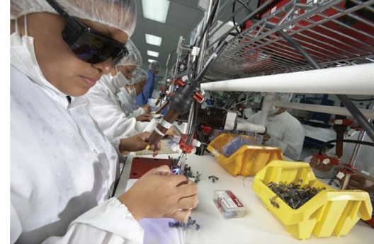
Figure 1. Assembly Cells at Tijuana Facility for Manufacturing SHPI Needle Assemblies