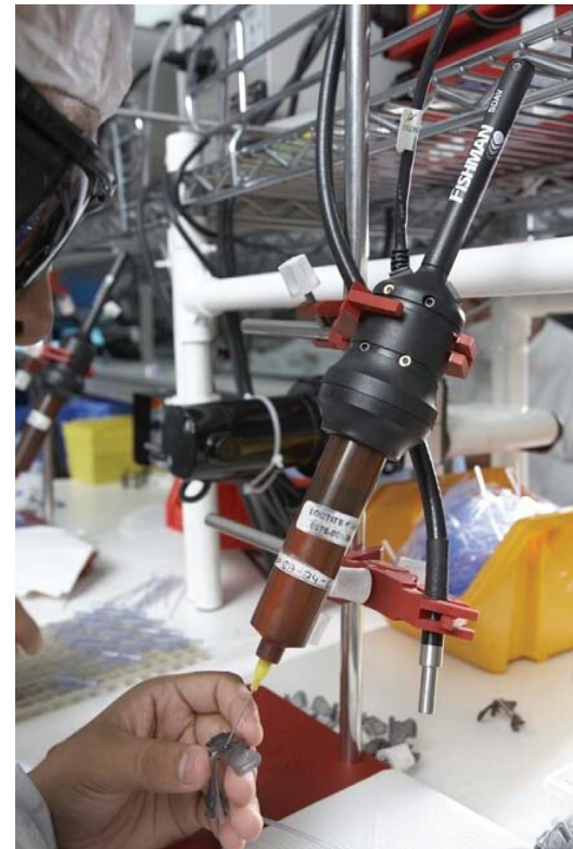
Figure 2. Dispensing of Adhesive in Assembly of MiniLoc™ Safety Infusion Set