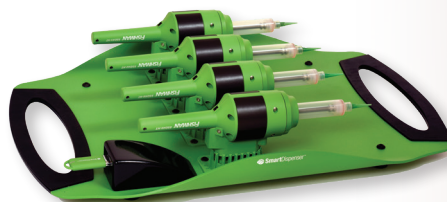
SmartDispenser® Gun Tray