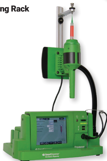
SmartDispenser® Priming Station